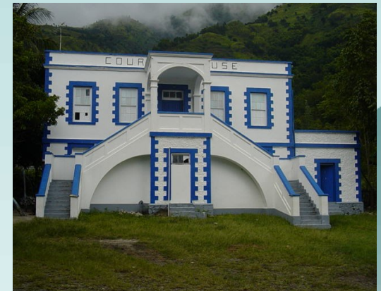
Cedar Valley Court House